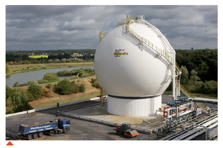
Formed segments welded together to make a complete sphere. Fitting and quality is an absolute requirement. Sphere in the picture is nearly 26 meters in diameter

Our expertise covers hot and cold forming, heat treatment, cutting, heavy plate working and welding – everything required for simple final assembly.